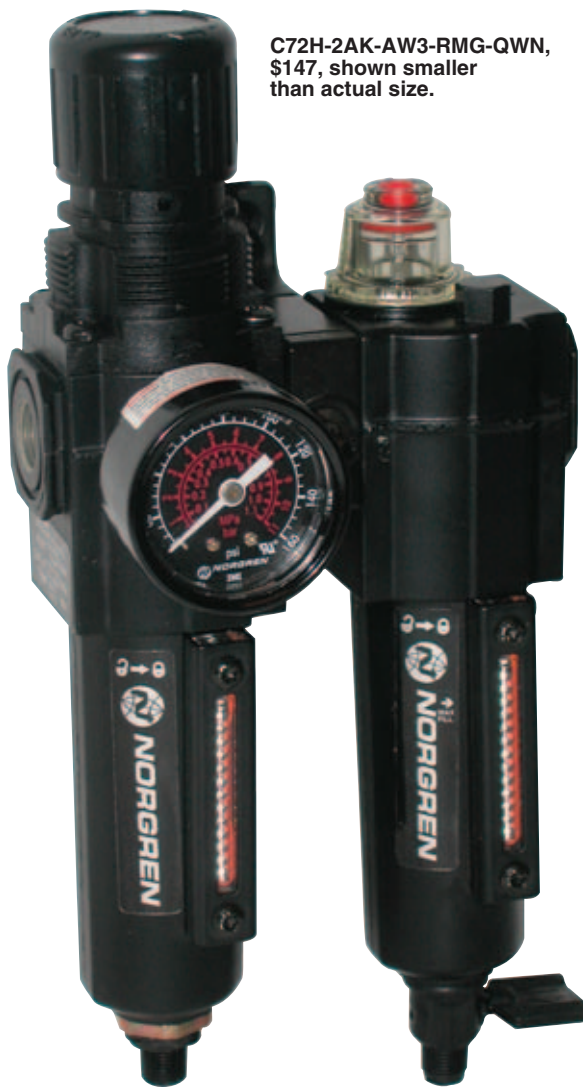
C72H-2AK-AW3-RMG-QWN, $147, shown smaller than actual size.