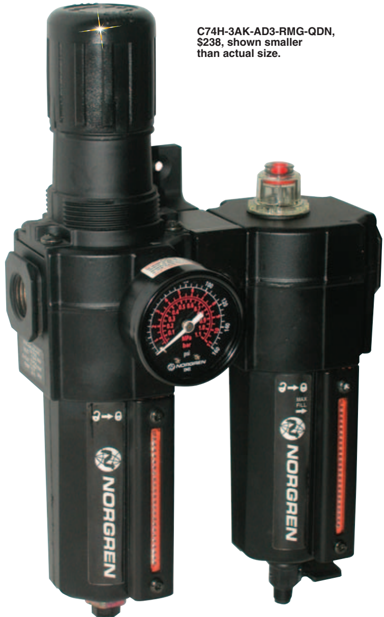
C74H-3AK-AD3-RMG-QDN, $238, shown smaller than actual size.