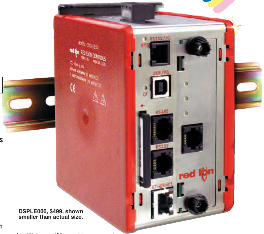
DSPLE000, $499, shown smaller than actual size.

The DSPSX000 and DSPGT000 offers several additional features beyond those offered by the DSPLE000. The CompactFlash® card allows data to be collected and stored for later review. The files are stored in simple CSV file format allowing common applications, such as Microsoft Excel and Access, to view and manage the data. The