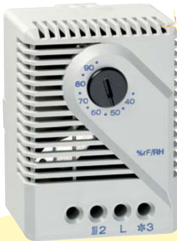
MFR01201220000, $78, shown larger than actual size.