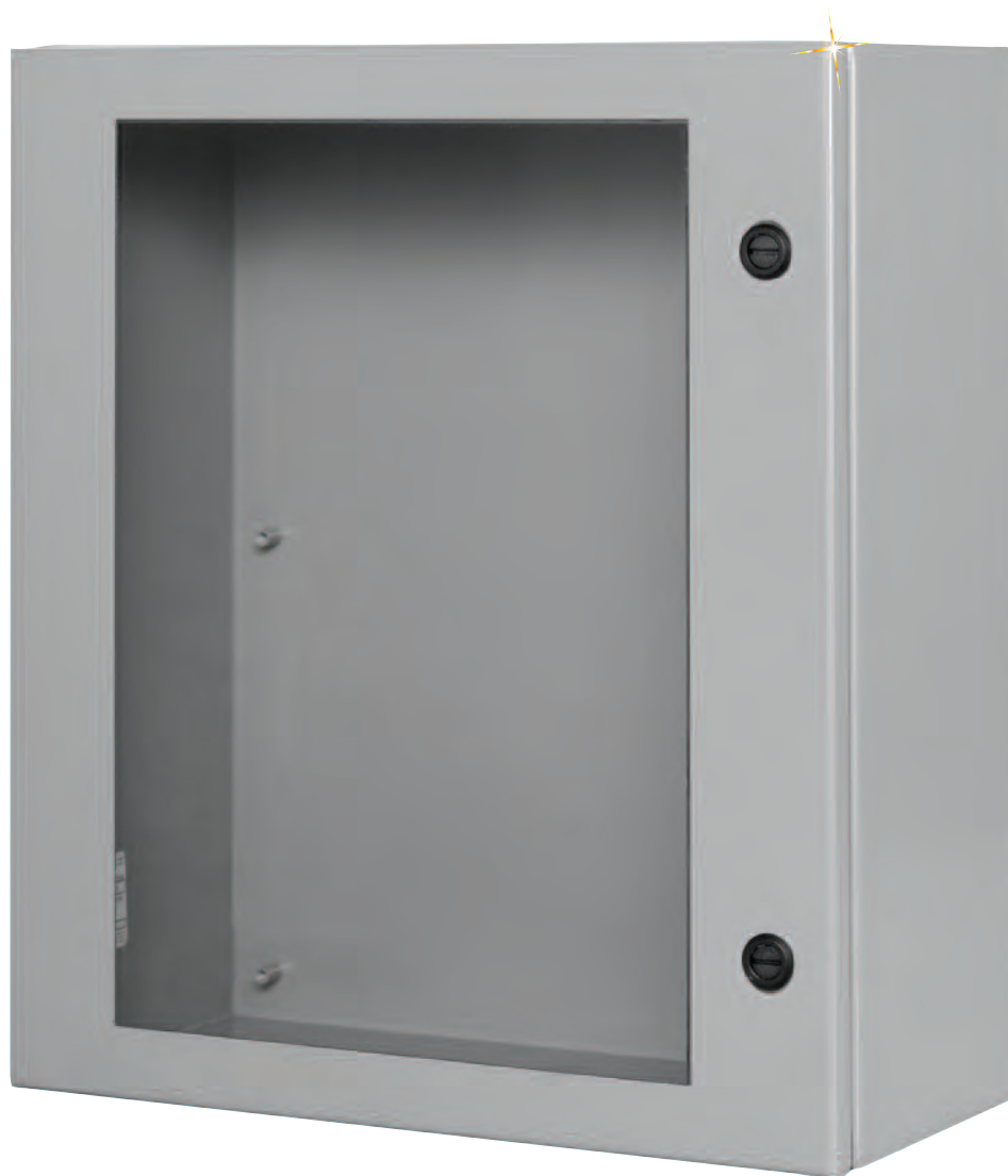
SCE-1614ELJW, $188, smaller than actual size.