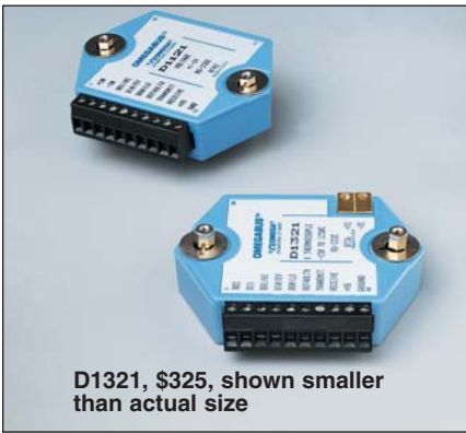
D1321, $325, shown smaller than actual size

This modular approach to data acquisition is very flexible, easy to use and cost effective. The modules can be mixed and matched to fit your application. They can be placed remote from the host and from each other. You can string up to 30 modules on one set of wires by using RS-485 with repeaters.