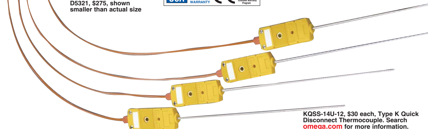
KQSS-14U-12, $30 each, Type K Quick Disconnect Thermocouple. Search omega.com for more information.