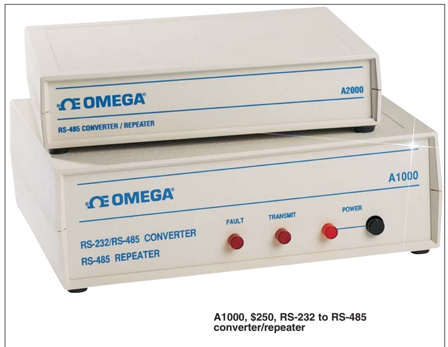
A1000, $250, RS-232 to RS-485 converter/repeater

RS-485 was developed for multidropped systems that can communicate at high data rates over long distances. For systems requiring many modules, high speed or long distances, RS-485 is recommended.