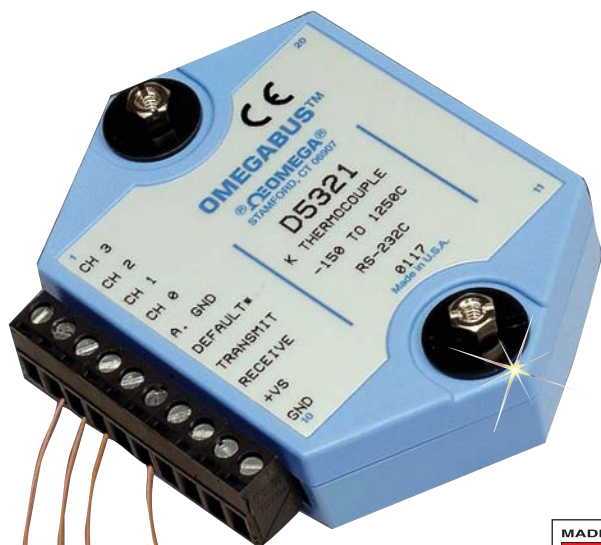
D5321, $275, shown smaller than actual size