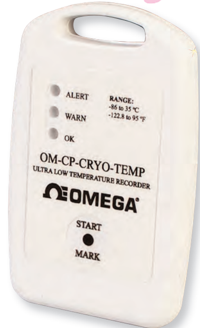
OM-CP-CRYO-TEMP, $199, shown actual size.