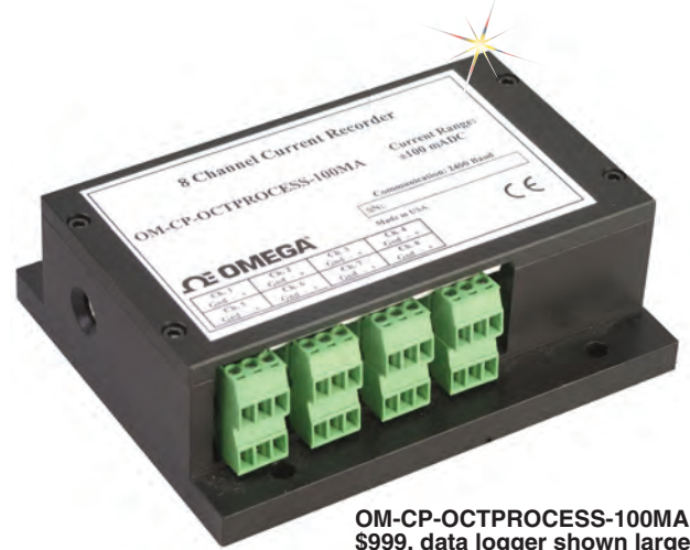
OM-CP-OCTPROCESS-100MA, $999, data logger shown larger than actual size.