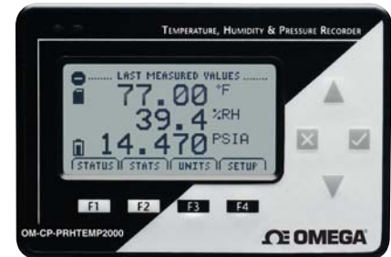
OM-CP-PRHTEMP2000, $499, shown smaller than actual size.