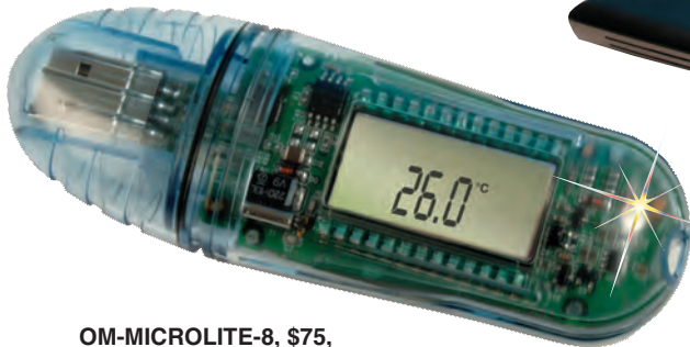
OM-MICROLITE-8, $75, shown actual size.

Display: LCD with decimal point; Visual Alert—Alarm icon when crossing predefined thresholds, low battery indication