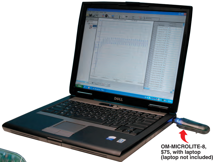
OM-MICROLITE-8, $75, with laptop (laptop not included)

Operation: Data scroll on the LCD, reed switch to start measuring