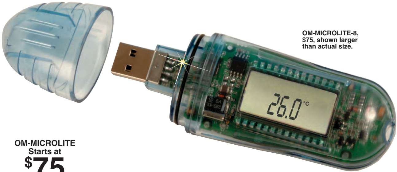
OM-MICROLITE-8, $75, shown larger than actual size.