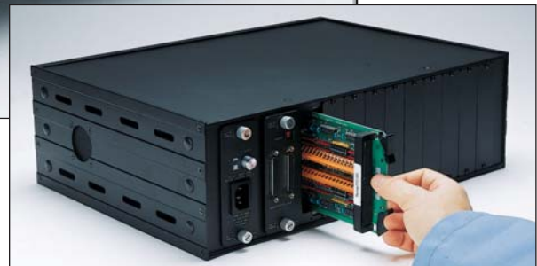
OMB-EXP-11A Optional Expansion Chassis, $1999

both high-speed and long-term datalogging. Many process control applications require occasional temperature monitoring until a limit condition occurs. Once an alarm is detected, the system often needs to accelerate temperature measurement and simultaneously provide closed-loop control signals until the process returns to steady-state conditions.