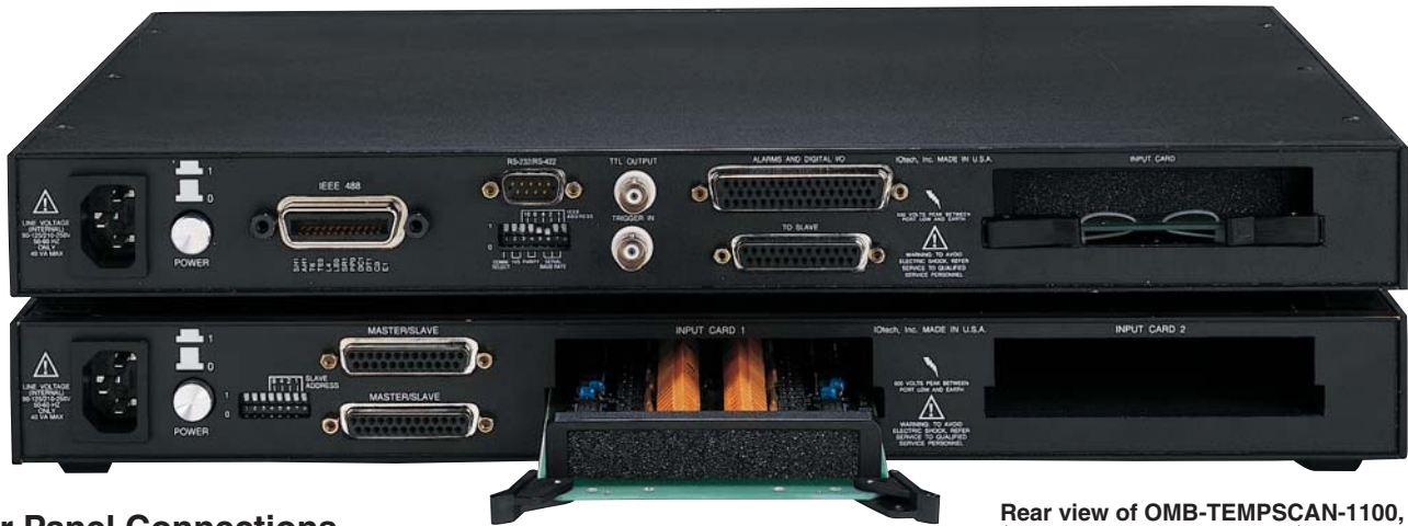
Rear view of OMB-TEMPSCAN-1100, $1499 and OMB-EXP-10A, $799