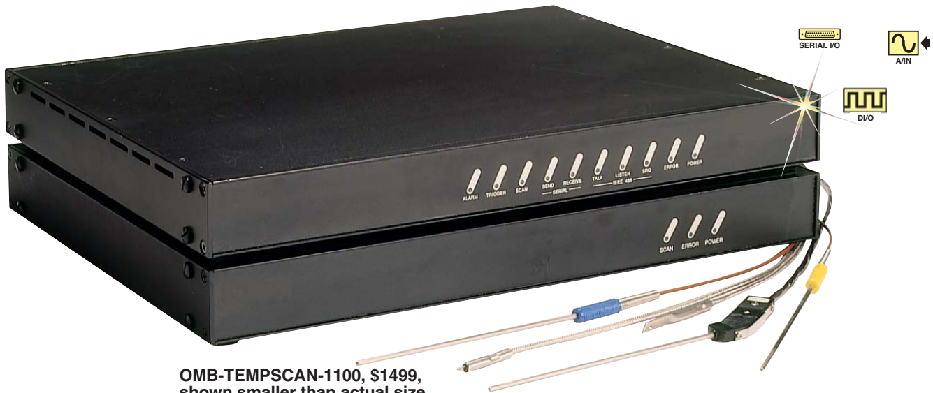
OMB-TEMPSCAN-1100, $1499, shown smaller than actual size

$1998 Basic Unit with OMB-TEMPTC-32B Input Module and Software