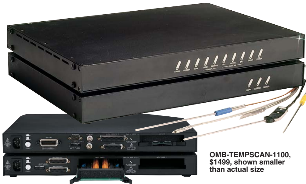
OMB-TEMPSCAN-1100, $1499, shown smaller than actual size

Programmable Triggering: Level (temperature or voltage), absolute time of day, alarm condition, IEEE GET, IEEE TALK, external TTL trigger