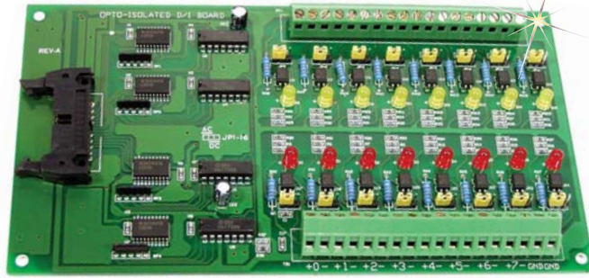
OME-DB-16P, $99, shown smaller than actual size