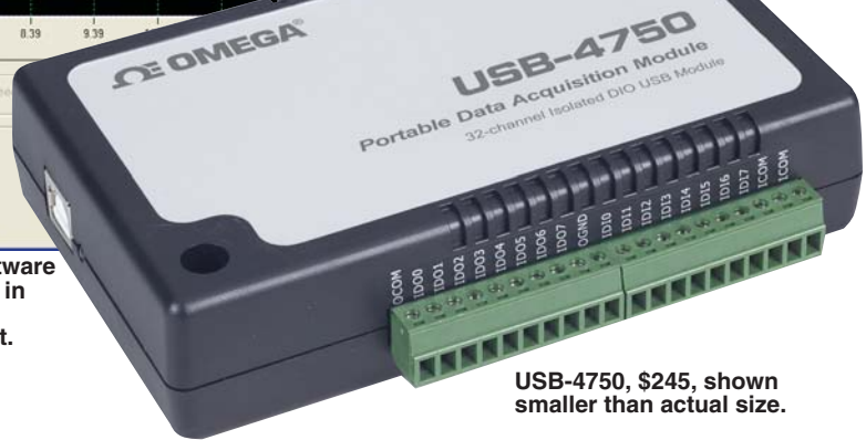
USB-4750, $245, shown smaller than actual size.

Windows software displays data in graphical or tabular format.