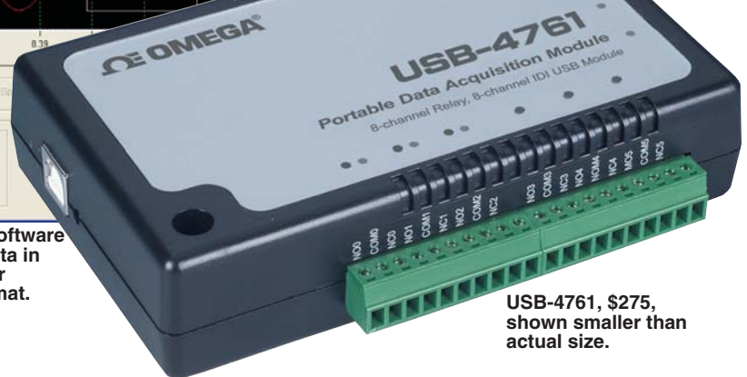
USB-4761, $275, shown smaller than actual size.

system from any incidental harms. If connected to an external input source with surge-protection, the USB-4761 can offer up to a maximum of 2000 Vdc ESD (Electrostatic Discharge) protection.