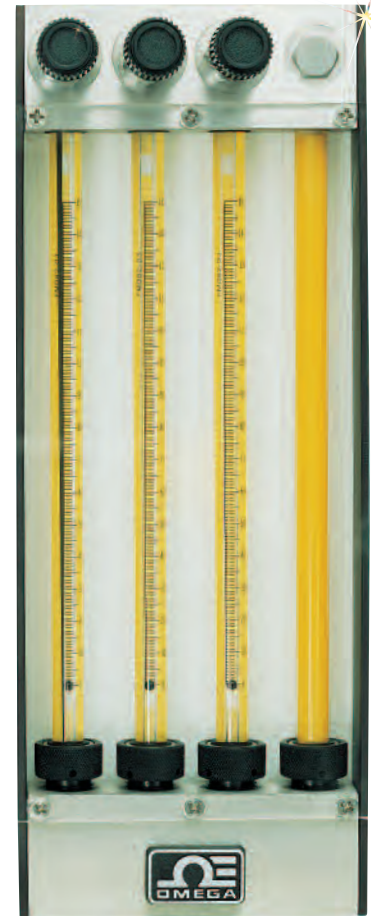
Shown smaller than actual size.

To blend two or three gases in homogeneous infinitely variable concentrations, directly at the end use point, these rotameters are unsurpassed in convenience and economy. Gas proportioning rotameters pay for themselves in a short period of time since their use eliminates the need for expensive custom blended gas mixtures from outside sources. This series of rotameters lend flexibility and economy to the efficient utilization of component gas cylinders and piped in supply lines. Another significant advantage in laboratory use is the freedom to reproducibly increase or decrease concentrations during the course of an experiment.