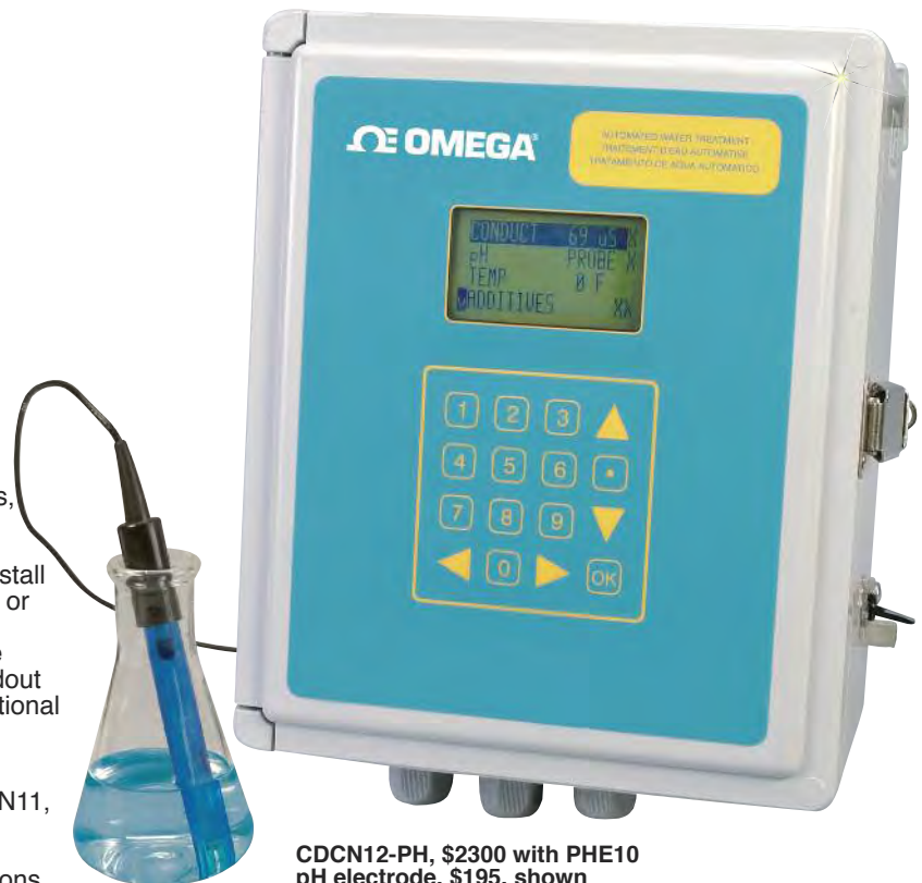
CDCN12-Ph, $2300 with PHE10 pH electrode, $195, shown smaller than actual size.