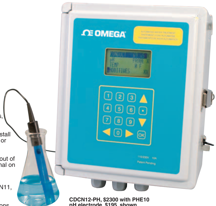
CDCN12-PH, $2300 with PHE10 pH electrode, $195, shown smaller than actual size.