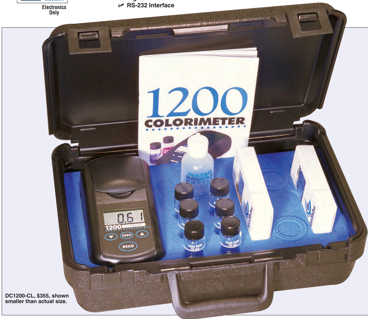
DC1200-CL, $355, shown smaller than actual size.

The DC-1200 Series of single-test, direct-reading colorimeters incorporates design advances that enhance reliability, improve accuracy and simplify the calibration process—all in a portable, handheld package.