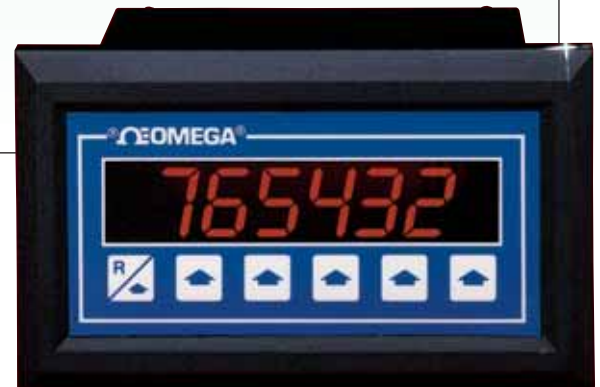
DPF66, $420, shown smaller than actual size. See page M-19 for details.

integral part of the sensor. The FD-5000 sensor is utilized on pipes that range in internal diameter from 25.4 to 508 mm (1 to 20").