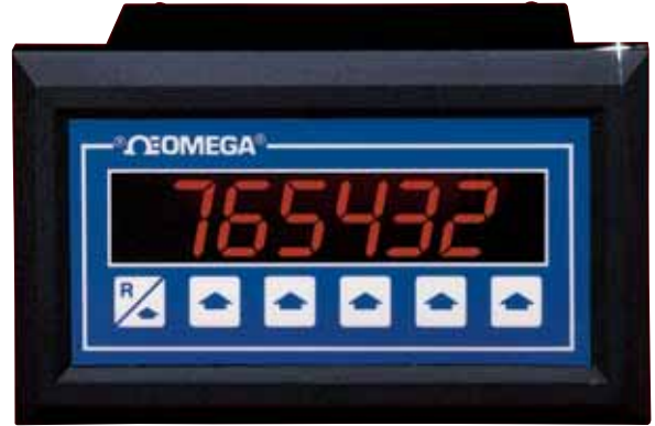
DPF66, $420, shown smaller than actual size. See page M-19 for details.