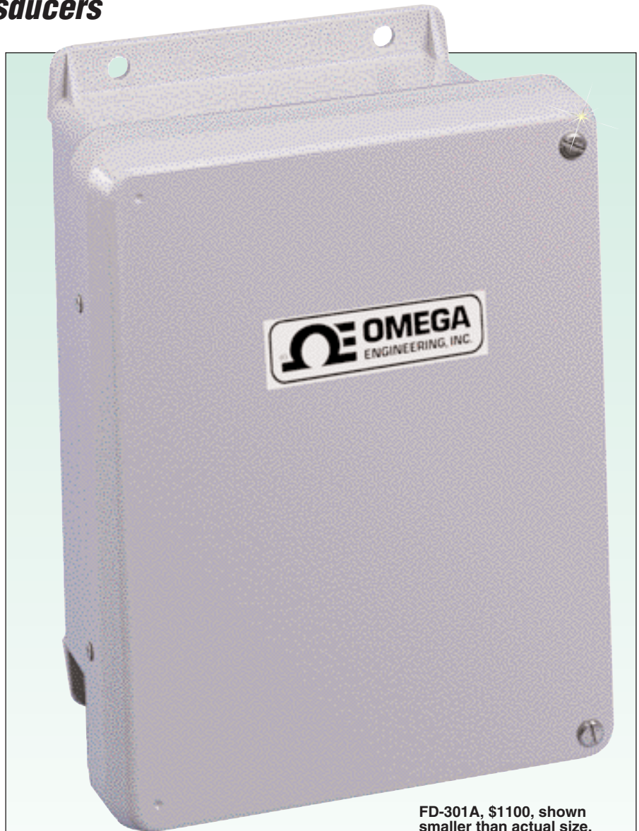
FD-301A, $1100, shown smaller than actual size.

The encapsulated, submersible, design of the transducer sensor head can be easily mounted to the pipe surface with the coupling compound and clamp supplied with the unit. A 6 m (20') cable for connection to the transmitter/indicator unit is supplied as an