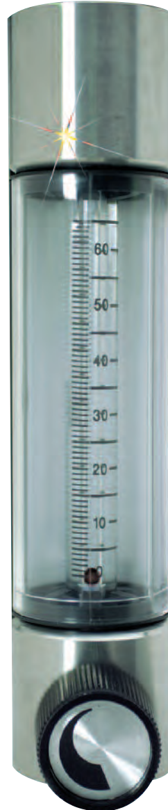
FL-5411G Series flowmeter, $250, basic model, shown actual size.