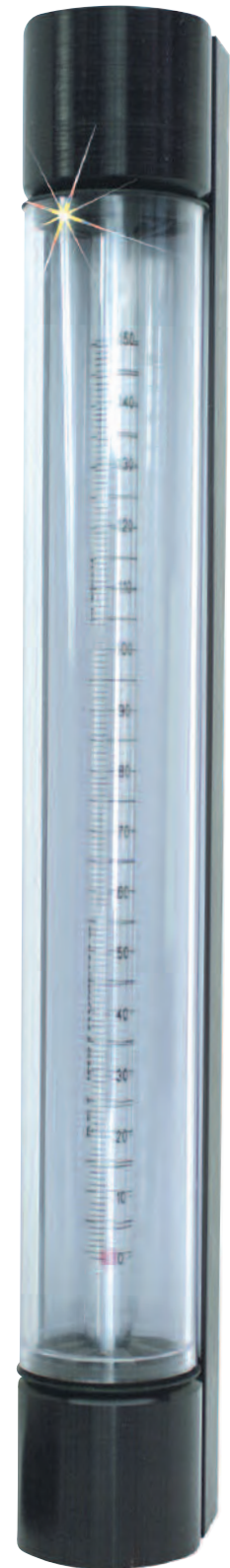
FL-5511G-NV Series flowmeter, aluminum, $123, basic model, shown smaller than actual size.

† Refer to footnote or next page for NIST calibration ordering information.