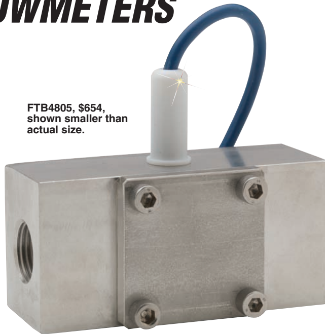
FTB4805, $654, shown smaller than actual size.