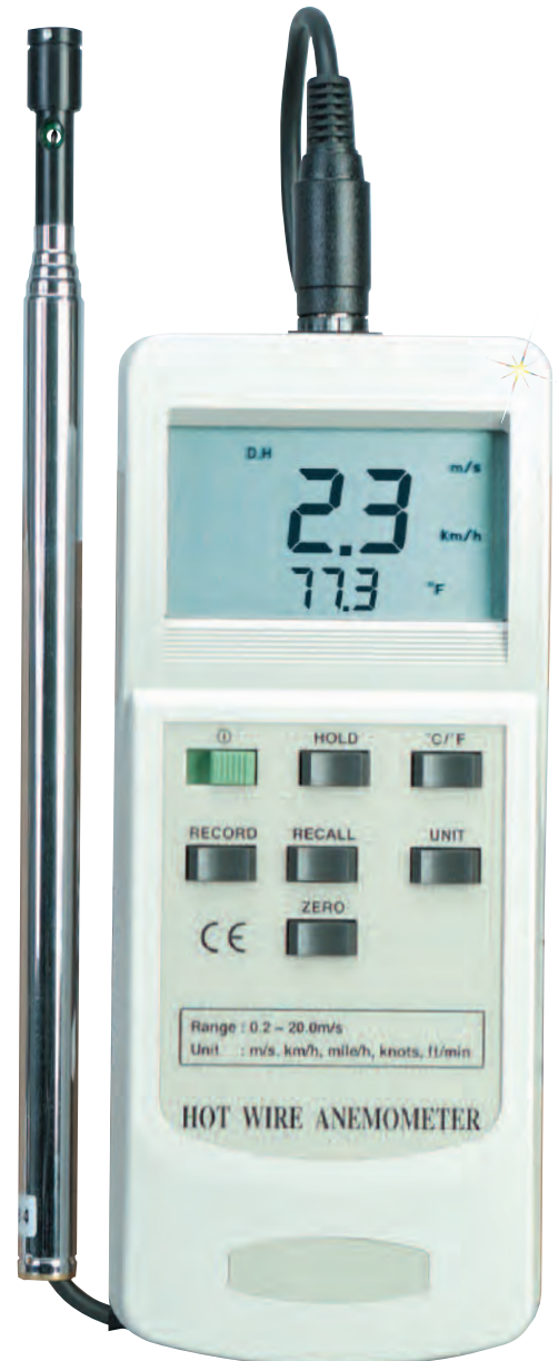
HHF42, $419 shown smaller than actual size.