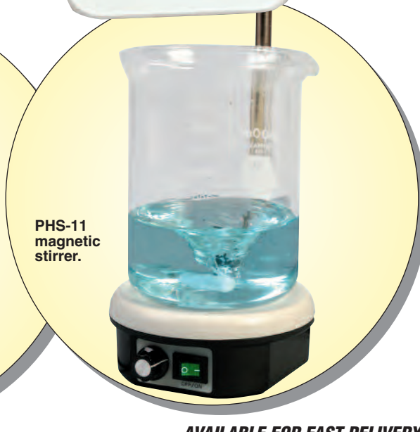
PHS-11 magnetic stirrer.