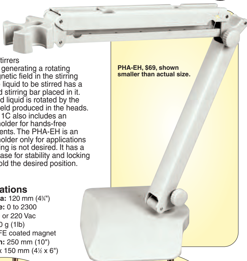
PHA-EH, $69, shown smaller than actual size.

The PHS-11 Series of magnetic stirrers operate by generating a rotating electromagnetic field in the stirring heads. The liquid to be stirred has a magnetized stirring bar placed in it. The bar and liquid is rotated by the magnetic field produced in the heads. The PHS-11C also includes an electrode holder for hands-free measurements. The PHA-EH is an electrode holder only for applications where stirring is not desired. It has a weighted base for stability and locking knobs to hold the desired position.