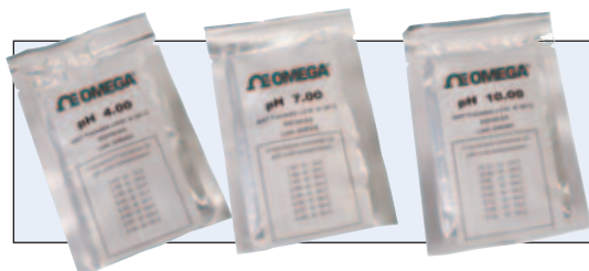
PHAB-PH, $20, 5 each 4, 7 and 10 buffer packs with 5 deionized water packs. Shown smaller than actual size.

Formulated to provide precise pH determinations, these buffer solutions which are standardized against NIST-certified reference samples, are ideal for calibrating electrodes and pH meters. The buffers are color-coded to avoid error and accurate to within \pm 0.02 pH at 25°C (77°F). Each buffer contains a preservative/mold inhibitor and a shrink-sealed cap to prevent contamination and leakage. Temperature compensation charts are included with each buffer solution.