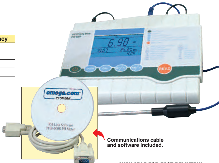
Communications cable and software included.