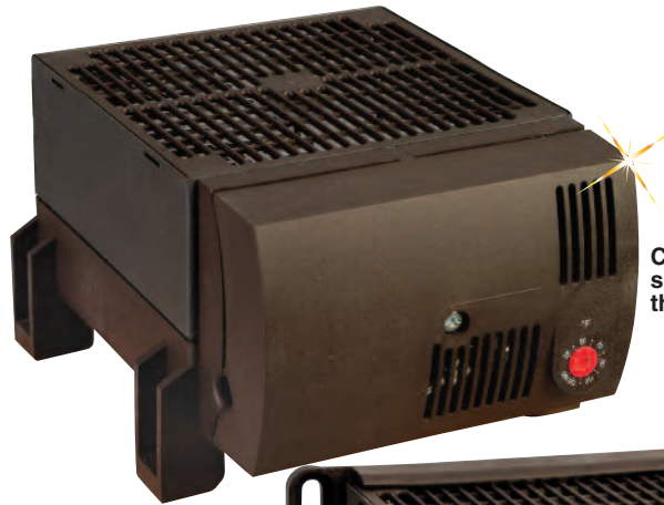
CR030599, $209, shown smaller than actual size.