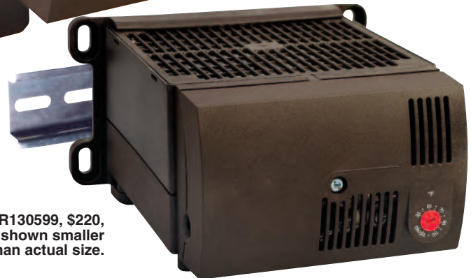
CR130599, $220, shown smaller than actual size.