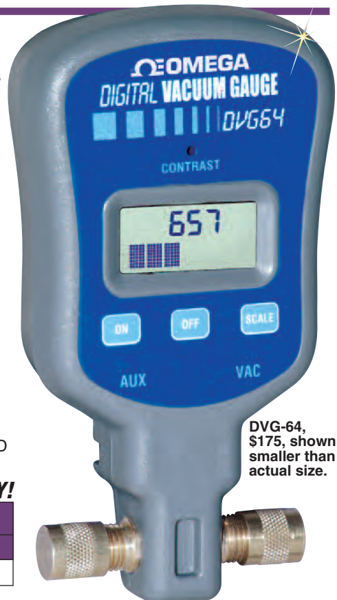
DVG-64, $175, shown smaller than actual size.

Display: Updated every 1/2 second; 1 micron resolution below 200 microns Sensor Type: Thermistor Connector Type: Standard 1/4" male flare fitting Vacuum Range: 0 to 12,000 microns (0 to 1600 Pa) with vacuum increasing/decreasing indicator when above 12,000 microns Scale: Microns, psi, inHg, mbar, Pa, torr, millitorr Operating Temperature Range: 2 to 52°C (35 to 125°F) Overpressure: 300 psi max (20 bar) Accuracy: ±10% (0 to 1000 microns) Power Source: 9V alkaline battery (included) Continuous Usage: Over 35 hr Auto Shut-Off: After 10 min when vacuum reading is above 12,000 microns Weight: 0.2 kg (6.7 oz) Dimensions: 140 H x 76 W x 32 mm D (5.5 x 3 x 1.25")