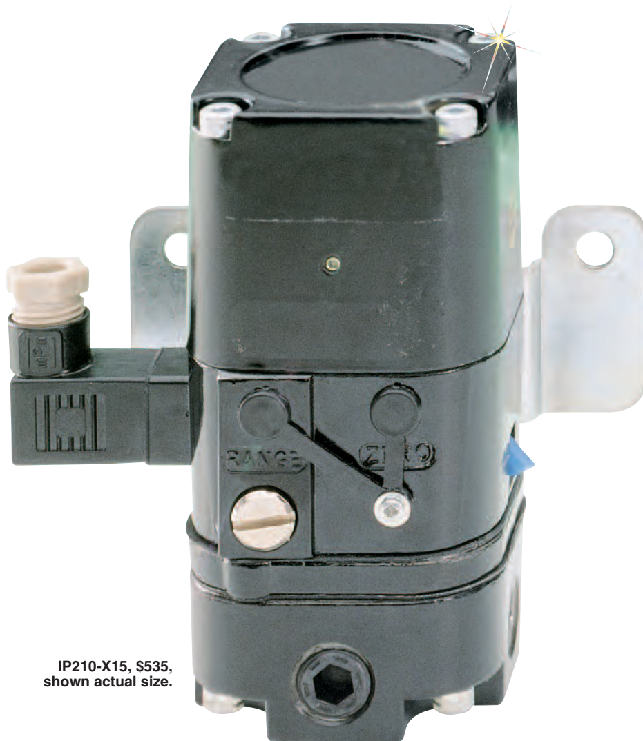
IP210-X15, $535, shown actual size.

OMEGA's IP210 converts an analog signal (4 to 20 mA) to a proportional linear pneumatic output (3 to 15 psig). Its uncomplicated design and proven electromagnetic force balance deliver consistently high performance.