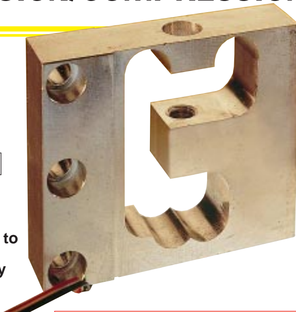
Shown Larger Than Actual Size