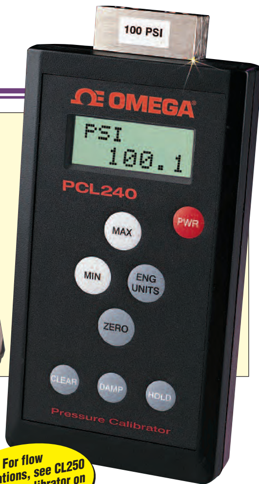
PCL240-100, $680, shown smaller than actual size.

For flow applications, see CL250 frequency calibrator on omega.com/cl250