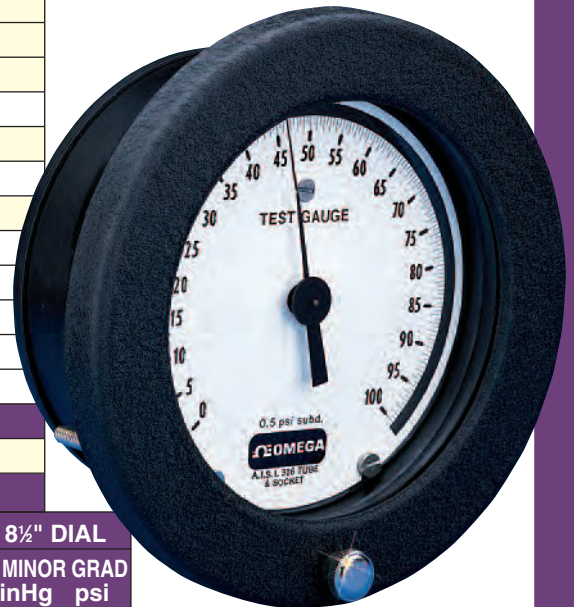
PGT-45B-100, back mount, $390, shown smaller than actual size. See dimensions on page G-61.

Recommended Reference Book: Pump Handbook, ME-0341, $150. Visit omega.com/bobi for Additional Books