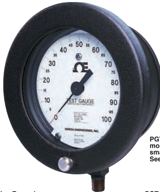
PGT-45L-100, stem or flush mount, $390, shown smaller than actual size. See dimensions above.