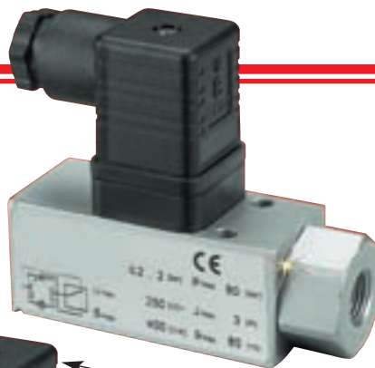
PSW18H Series Hydraulic Switches