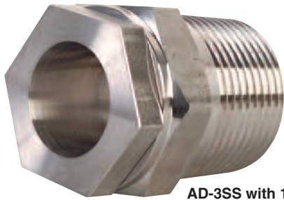
AD-3SS with 1 NPT fitting, $130, shown actual size.