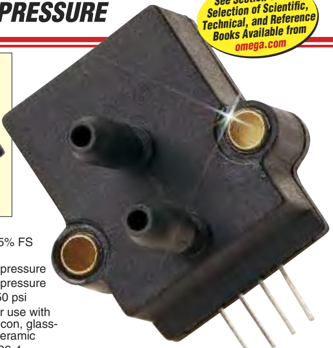
PX138-001D5V, $105, shown 2.5x larger than actual size.

Span Temp Effects: \pm 0.5\% FS ( \pm 1\% FS for 0.3 psi) Proof Pressure: > 3x FS pressure Burst Pressure: > 5x FS pressure Common Mode Press: 50 psi Media Compatibility: For use with gases compatible with silicon, glass-filled nylon and alumina ceramic Mating Connector: CX136-4 (sold separately)