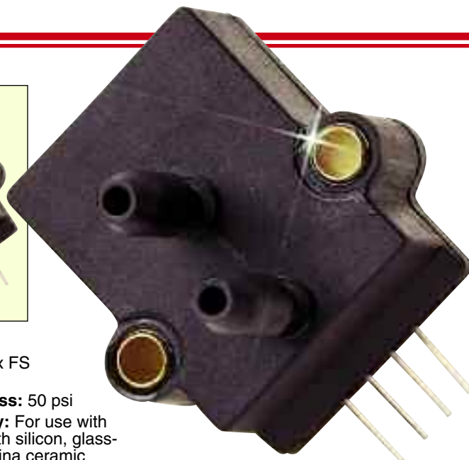
PX139-001D4V, $90, shown 2.5x larger than actual size.