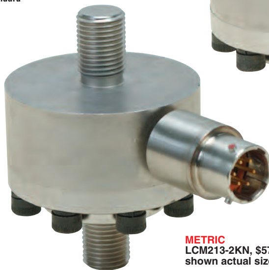
STANDARD LC203-100, $575, shown actual size.