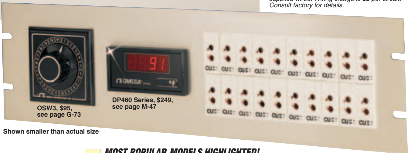
OSW3, $95, see page G-73

Consult Sales Department for information on custom, color-coded anodized panels.