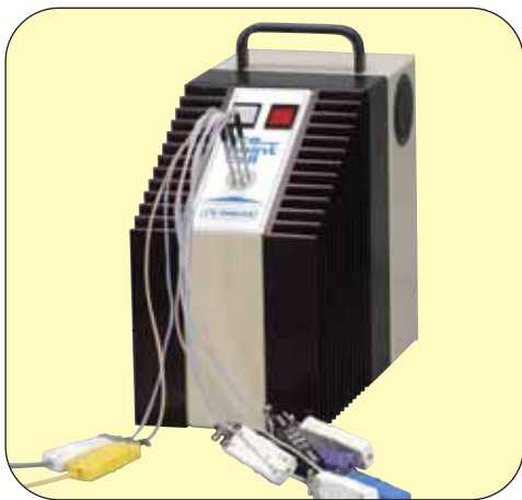
OMEGA's ice point™ is a highly accurate 0°C (32°F) thermoelectric "refrigerator" used in the calibration of temperature instruments. Model TRCIII, $1175. See page K-15.