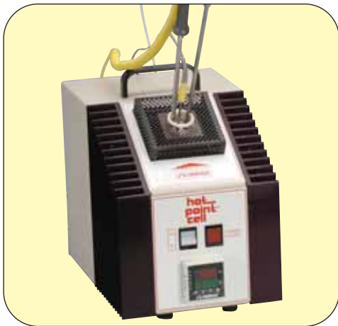
OMEGA's hot point® thermocouple and RTD calibrator calibrates all temperature sensors to within ±1.5°F. Model CL900-110, $2995. See page K-25.