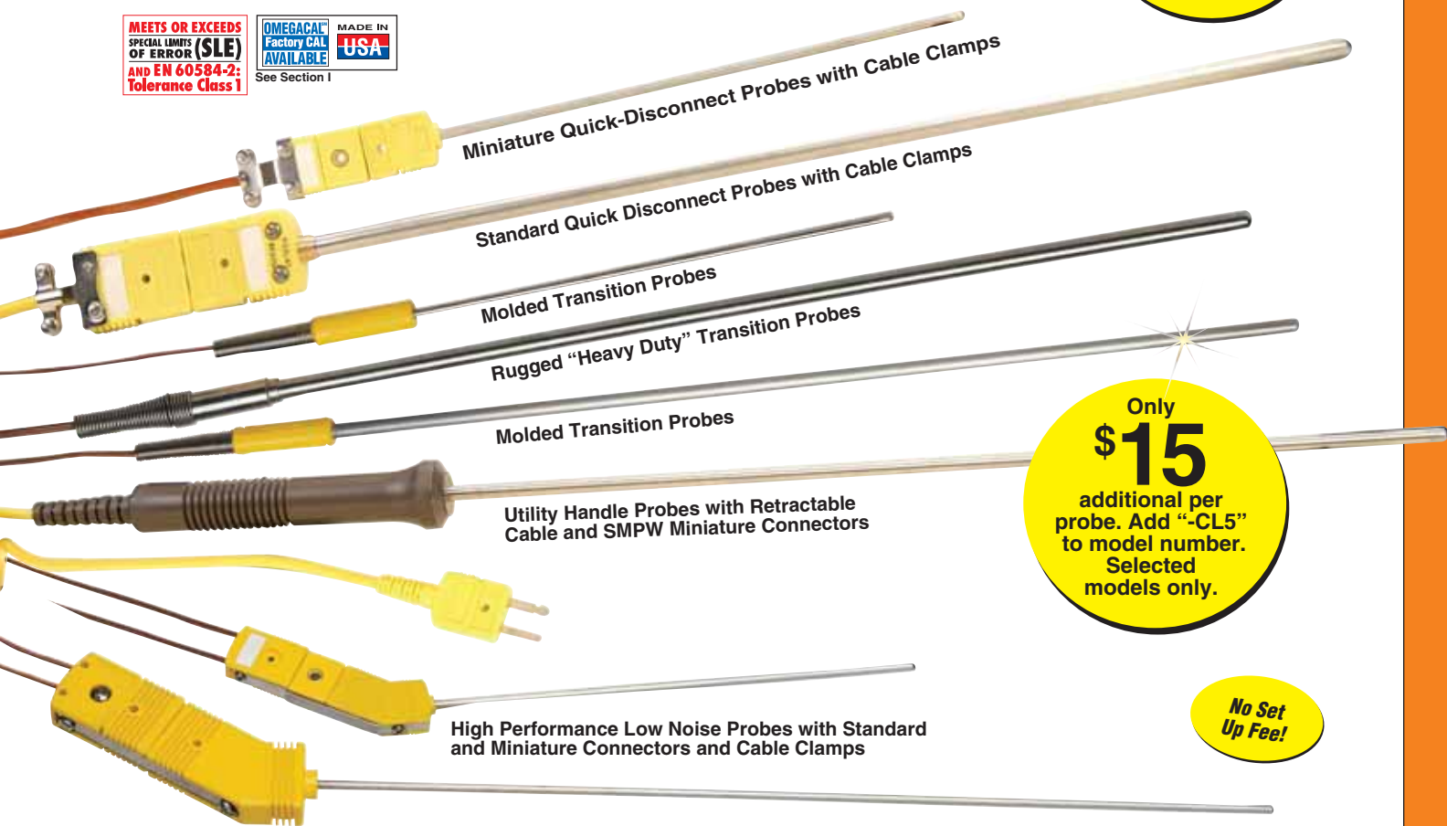
Miniature Quick-Disconnect Probes with Cable Clamps

MEETS OR EXCEEDS SPECIAL LIMITS OF ERROR (SLE) AND EN 60584-2: Tolerance Class 1 OMEGA CAL Factory CAL AVAILABLE MADE IN USA See Section I