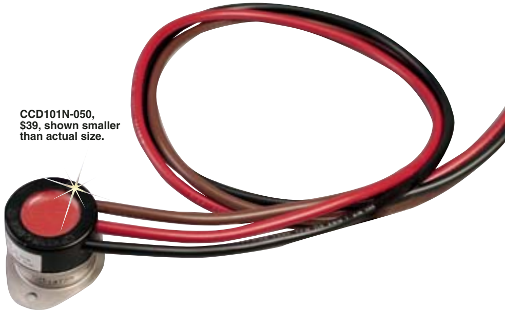
CCD101N-050, $39, shown smaller than actual size.