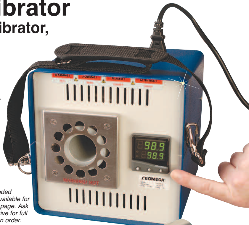
Insert removal tool included.

OMEGACARE SM extended warranty program is available for models shown on this page. Ask your sales representative for full details when placing an order. OMEGACARE SM covers parts, labor and equivalent loaners.