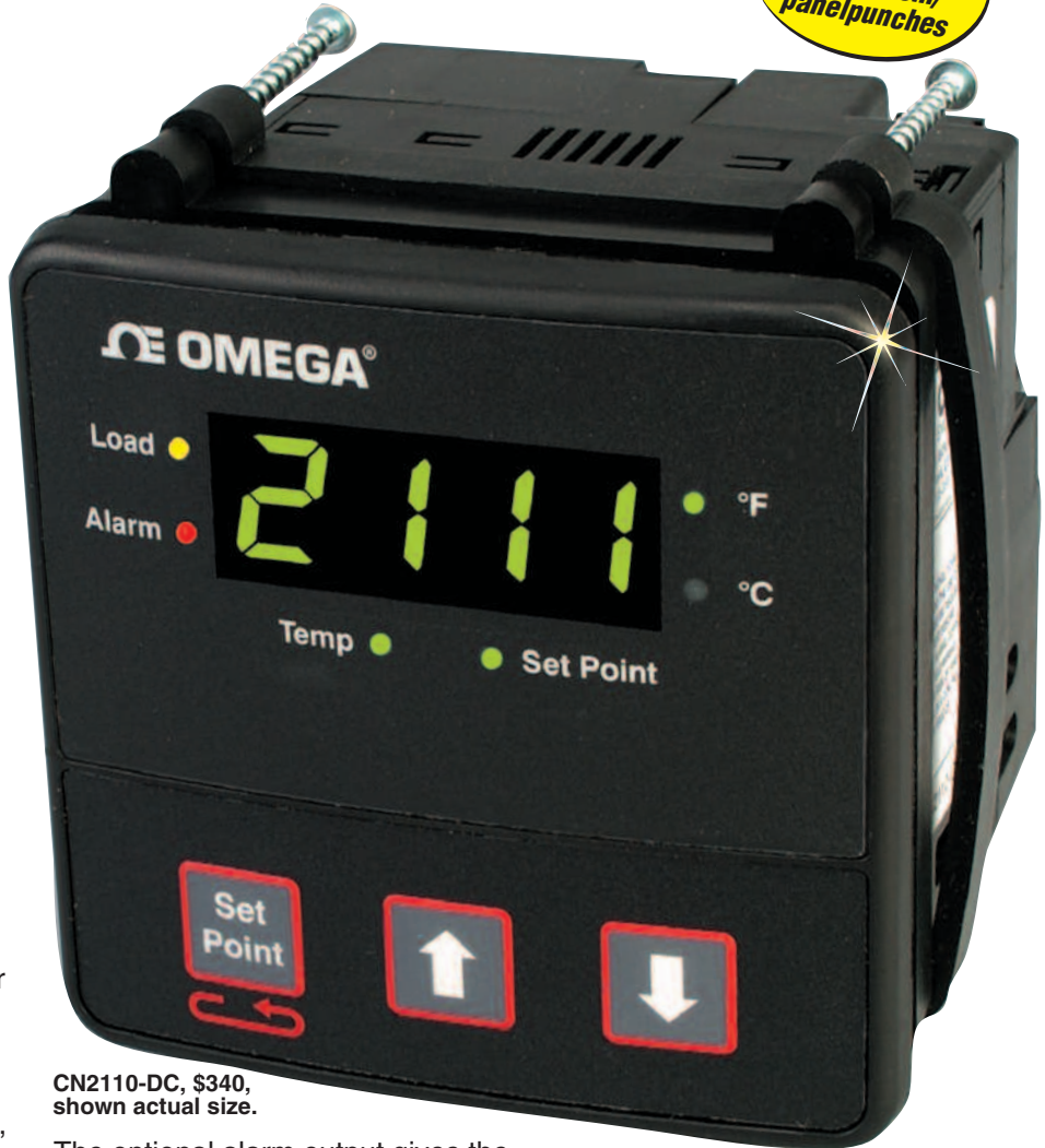
CN2110-DC, $340, shown actual size.

The CN2110 features a variety of output modules including high-current options of a 10 A solid state relay or 20 A mechanical relay. These outputs can directly control many cartridge or strip heaters, eliminating the need for a remote contactor or solid state relay. For larger, 3-phase loads, the CN2110 can drive a remote device with the pilot duty relay or solid state relay drive outputs.