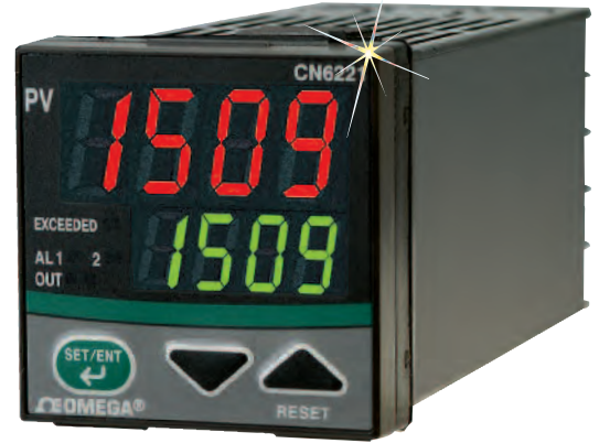
CN6221-R, $205, shown smaller than actual size.

Panel Punches Available Visit omega.com/panelpunches