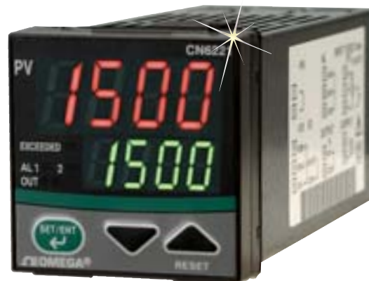
CN6221-R, $195, shown smaller than actual size.

Panel Punches Available Visit omega.com/panelpunches