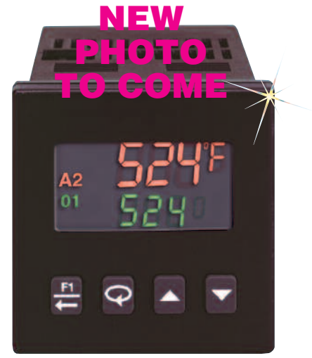
CN63200-R1, $125, shown actual size.