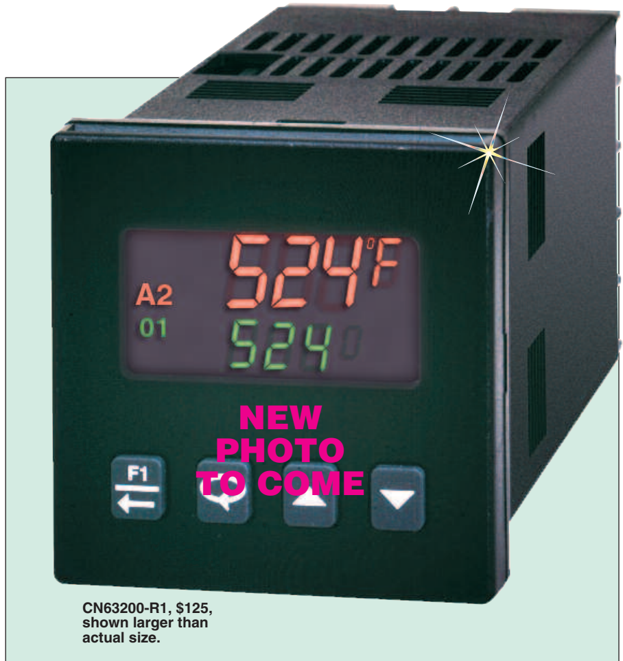
CN63200-R1, $125, shown larger than actual size.

Display: 2-line by 4-digit, LCD negative image transmissive with backlighting Top (Process) Display: 7.6 mm H (0.3") digits with red backlighting Bottom (Parameter) Display: 5.1 mm H (0.2") digits with green backlighting