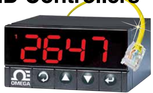
Shown smaller than actual size.

The universal temperature and process instrument (CNI models) handles 10 common types of thermocouples, multiple RTDs, and several process (DC) voltage and current ranges. This model also features built-in excitation, 24 Vdc @ 25 mA. With its wide choice of signal inputs, this model is an excellent choice for measuring or controlling temperature with a thermocouple, RTD, or 4 to 20 mA transmitter.