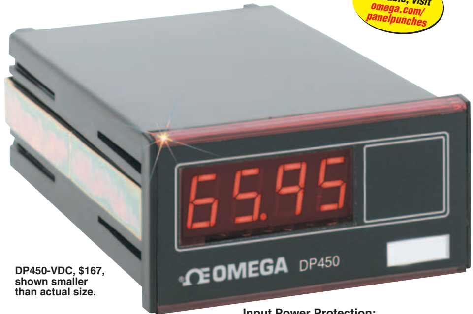
DP450-VDC, $167, shown smaller than actual size.

Panel punches available, visit omega.com/panelpunches