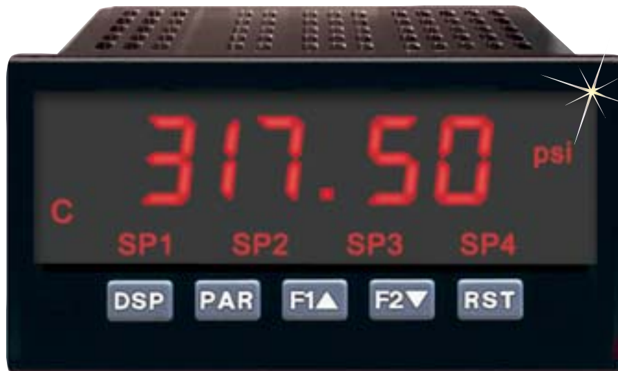
DP63800-E, $243, shown larger than actual size.

The DP63800 Series panel meters offer many features and performance capabilities to suit a wide range of industrial applications. Models include universal DC process inputs. The optional plug-in output cards allow the opportunity to configure the meter for present applications while providing easy upgrades for future needs. The meters have a bright 14.2 mm (0.56") LED display. The unit is available with a red, sunlight-readable or a standard green LED. The intensity of display can be adjusted from dark-room- to sunlight-readable, making it ideal for viewing in variable light applications.