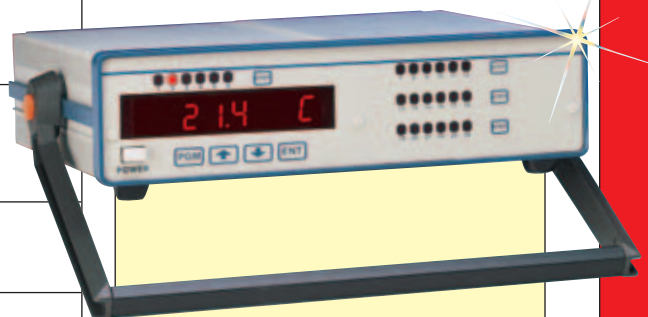
DP85T, $679, shown smaller than actual size.