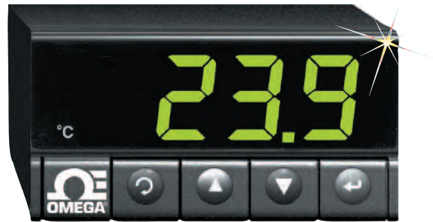
DPI8, $250, shown smaller than actual size.

CNi Series Models with Control and Alarm Outputs, See Pages P-9 thru P-22