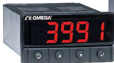
DPI32, $159, shown smaller than actual size.

Panel Punches Available, Visit omega.com/panelpunches