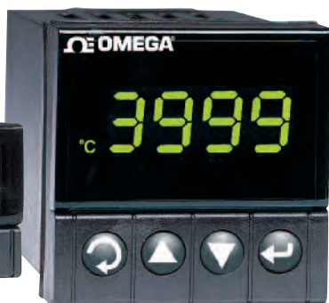
DPI16, $190, shown smaller than actual size.