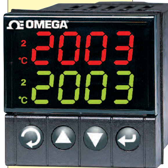
CNI16D, shown larger than actual size. See page P-17.

integrated circuit), patented algorithms and smart filtering.