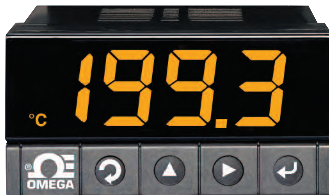
DPI8, $250, shown smaller than actual size.