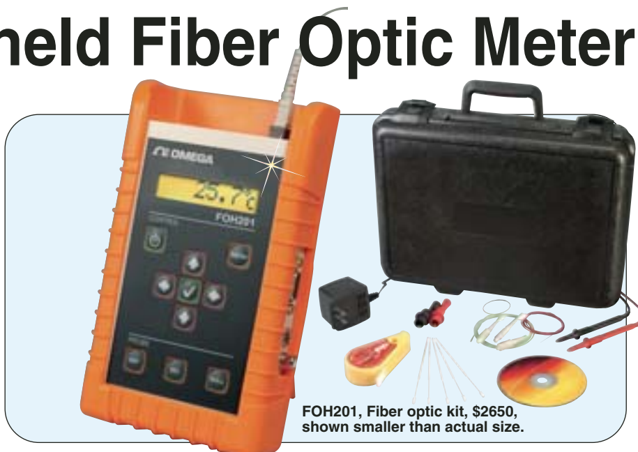
FOH201, Fiber optic kit, $2650, shown smaller than actual size.

The FOH201 is equipped with a large visible LCD display and can be battery operated. It comes with a standard ±5V analog output and a RS232 communication port for real-time data acquisition. The FOH201 can be controlled directly using the