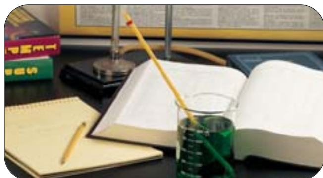
Available with red safety liquid, in a variety of ranges and styles.

Economical glass-bulb thermometers are ideal for school and laboratory applications. These general-purpose, easy-to-read white back units are available with red liquid filling, in a variety of ranges and styles.