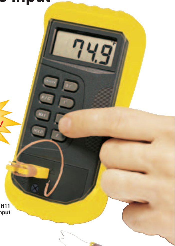
Model HH11 Single Input

TJFT72-K-SS-116G-6 thermocouple probe sold separately.