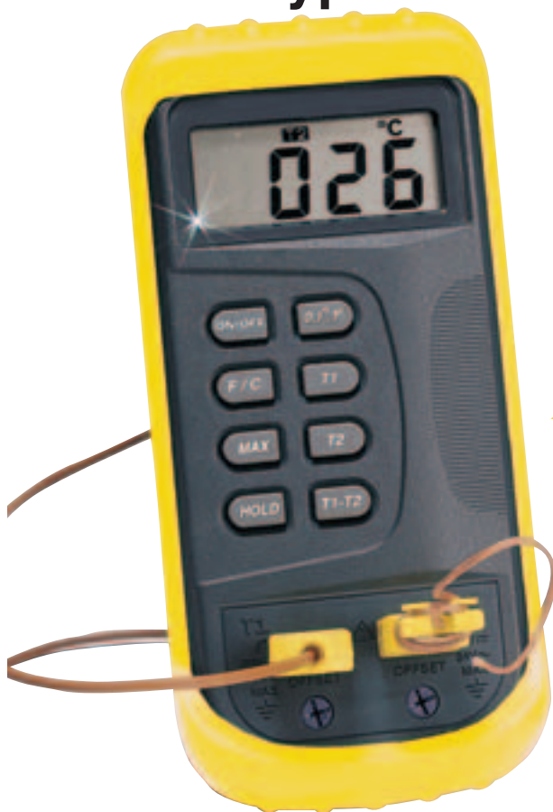
Model HH12 Dual Input

High Accuracy Models Available! See HH-20 Series on page L-33.