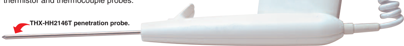
THX-HH2146T penetration probe.

This generation marks an evolutionary step in the development of OMEGA's digital thermometers and probes. These thermometers are completely waterproof and incorporate the Food Industry standard Lumberg connector for thermistor and thermocouple probes.